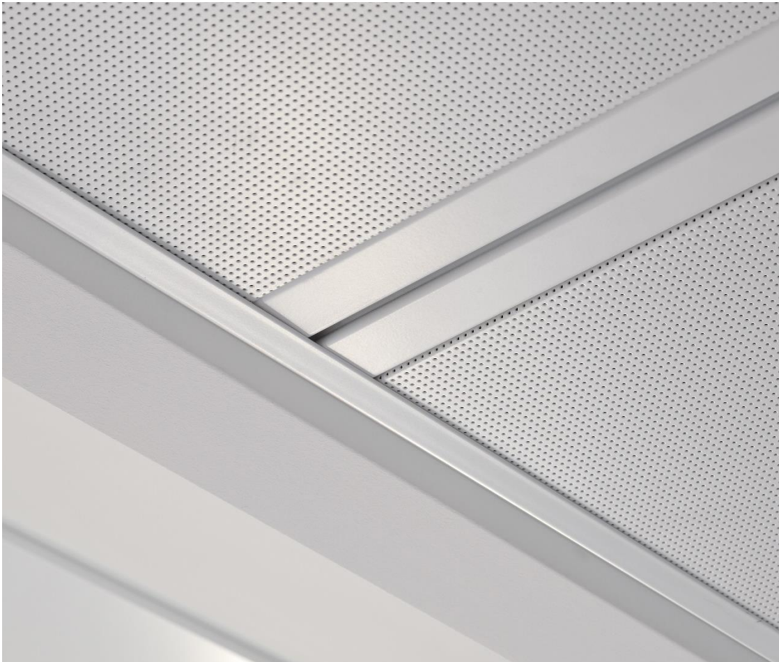
Metal Ceiling System SAS330 Chilled – Aluminium CPC Code 42190

EPDs of construction products may not be comparable if they do not comply with the BS ISO EN15804:2012 standard