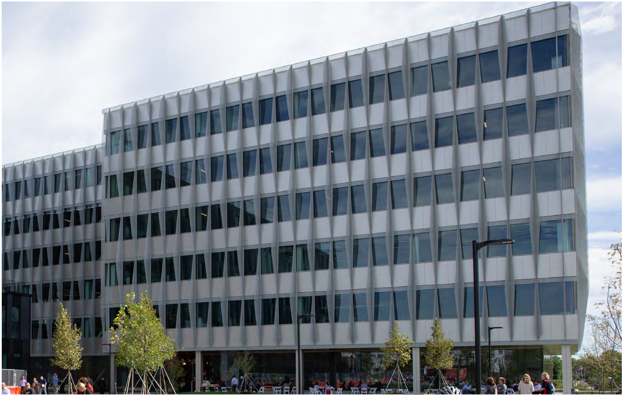
This project for the University of Cincinnati, designed by GBBN architects, provides a stunning new six story facility focused upon interdisciplinary research.